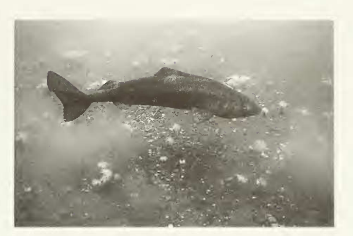
FIGURE 4: Male Greenland Shark posturing, exhibiting curvature of the dorsum, having just shown rapid downward flexion of head and tail, contacting the silt-covered substrate, which caused the visible cloudiness ahead of and behind the animal. This motor pattern was elicited in response to presence and close proximity of divers.

Our perception of this species as a predator of benthic fishes and a sluggish, blind, olfactory scavenger of marine mammal carcasses, with an important ecological role as a mammal "carcass opening" species in Arctic deep water ecosystems (Snelgrove and Smith 2002) has changed as a result of these first-hand observations. Though descriptions of active predation by Greenland Sharks have not been reported in the scientific literature, there is evidence that this species is capable of actively stalking and killing marine mammals as well as scavenging the carcasses of marine mammals. Ridoux et al. (1998) documented a freshly killed juvenile Ringed Seal, Phoca hispida (Schreber, 1775), with bite marks across the chest, found in the stomach of a 4.5 m Greenland Shark off Iceland. Our underwater